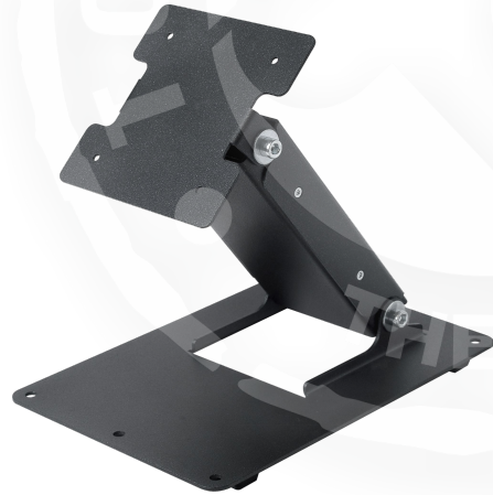
010402 - pivoting table stand, tiltable

Control units can be installed with a pivoting table stand or wall/column-mounted