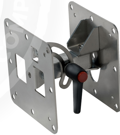
010401 - wall mount tilting bracket